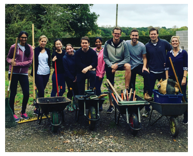
The CREG team went back to nature to help Noah's Ark Children's Hospice with their gardens.